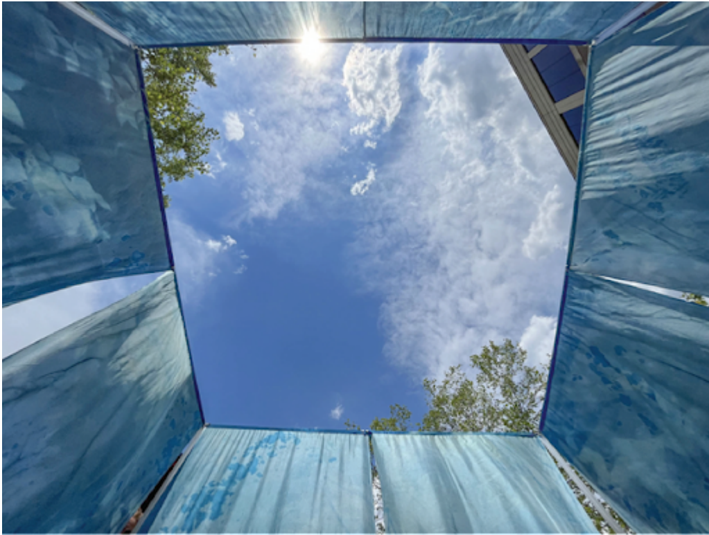
BMAC Climate Change Artist-in-Residency Exhibition: where are we?