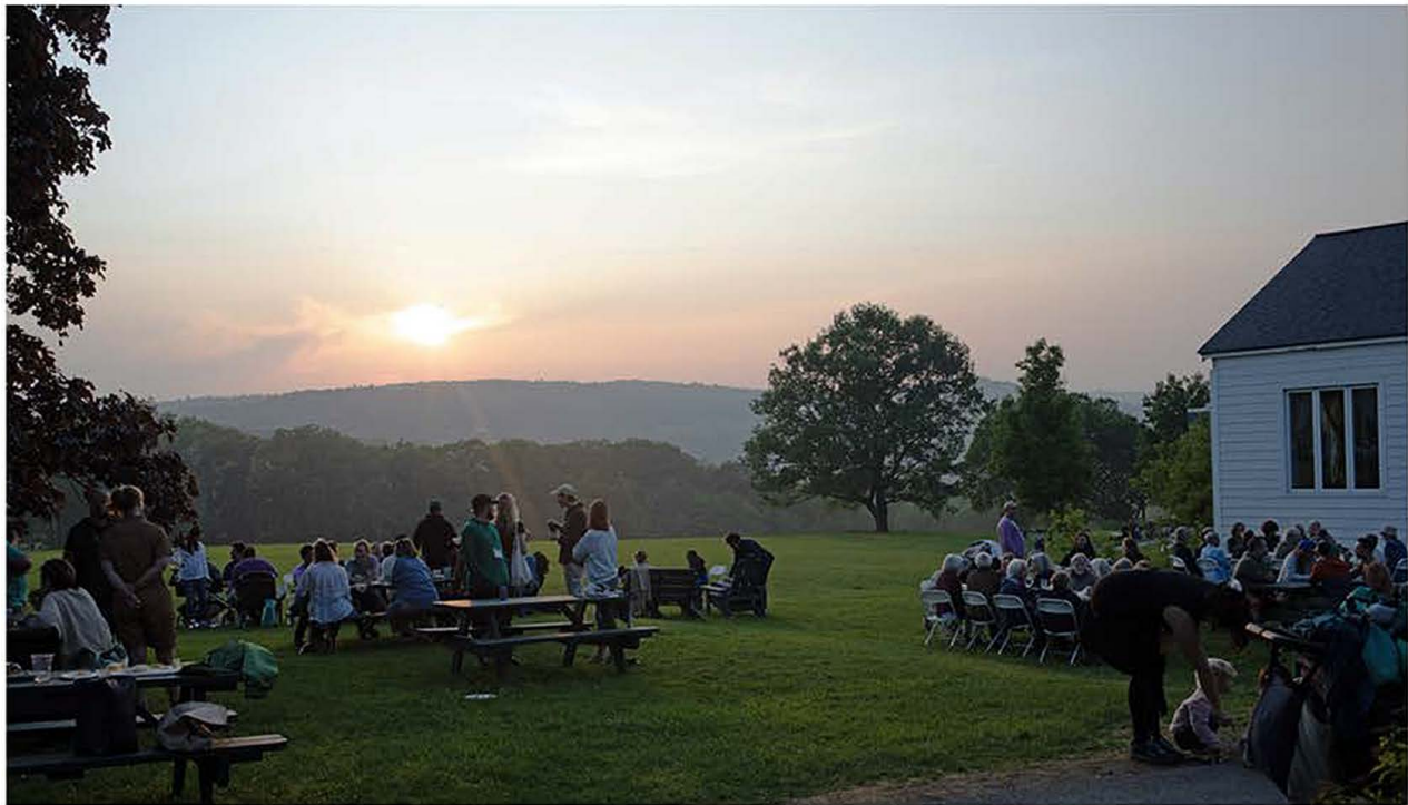
Photo: The Sun Finally Came Out at Reunion