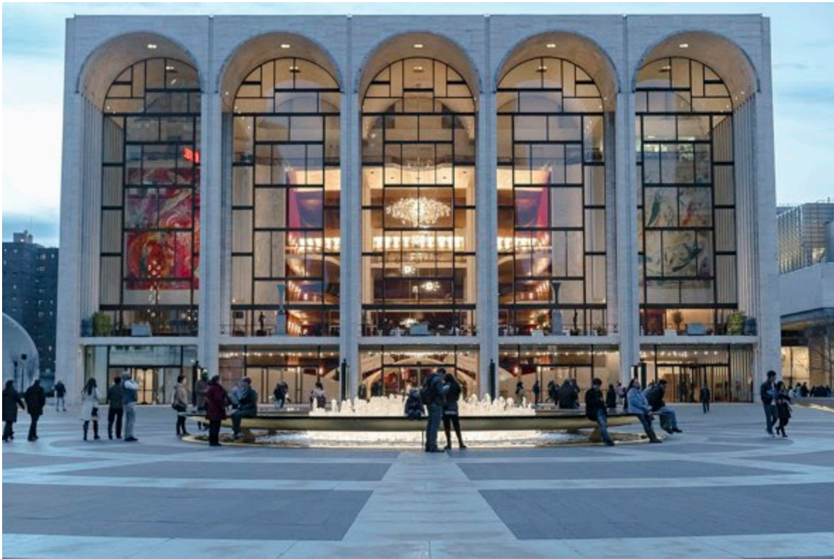
The Metropolitan Opera.